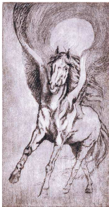
"Runway 3-5 Clear" by Dennis Liberty is a masterfully executed dry point etching of Pegasus that resides among the best quality prints.

All three unapologetically romantic compositions combine mythology with fine drawing skills and a subtle modicum of creative imagination. That formula produces an unbeatable narrative content.