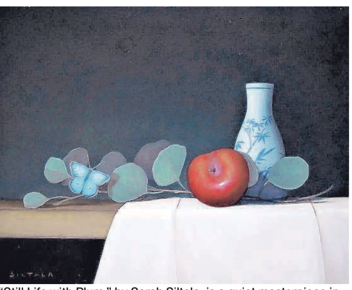
"Still Life with Plum," by Sarah Siltala, is a quiet masterpiece in the "Objects of Desire: The Still Life Show" at the New Mexico Art League Gallery.

Wagner's brushwork and handling of morning light is distantly reminiscent of works by East Coast painter and critic Fairfield Porter (1907-1975).